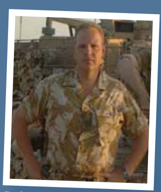
Politically in this country, we are lions led by donkeys!

The Former Soldier "Born and bred here" joined the Social Democratic Party 5 years ago, as it was obvious that the main parties no longer represent the views and needs of the British people.